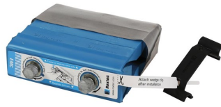
Wedge 120 galv ES