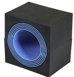
RM 80 UG WOC