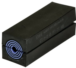
RM 20 UG