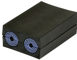
RM 20w40 UG