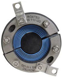
RS 110 UG