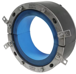
IMG_6572 RS 200 UG WOC fix.tif