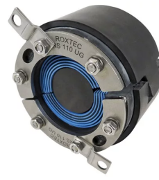
RS 110 UG