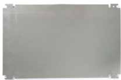
Galvanized steel full-size panel