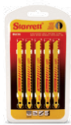
Ex.: BU36 Blister with 5 sheets