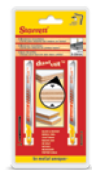
Ex.: BU2DCS-2 Blister with 2 sheets