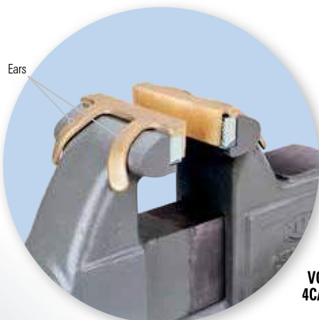
VC4 on 4CA vise