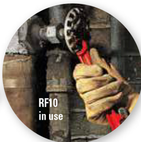
RF10 in use

Keep this lightweight 2-in-1 wrench handy all day!