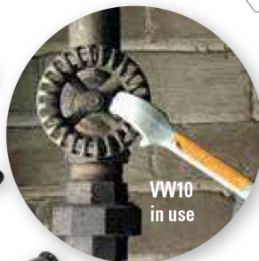
VW10 in use