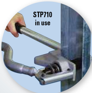
STP710 in use