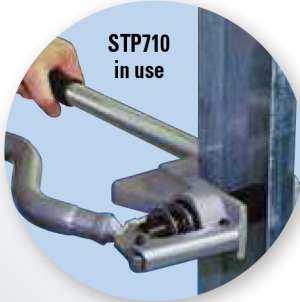
STP710 in use