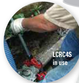
LCRC4S in use