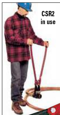
CSR2 in use