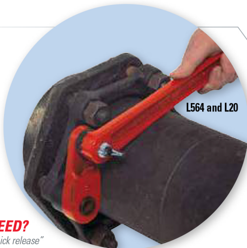
L564 and L20