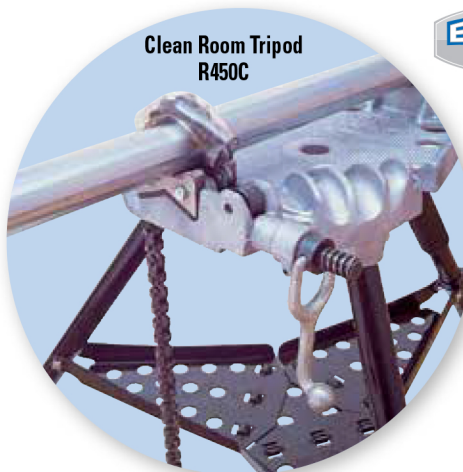
Clean Room Tripod R450C

The R450C Clean Room Tripod comes with reversible, stainless steel, bowtie jaws with regular jaw teeth on one side and rubber-coated jaws on the other side. The tripod has an anodized aluminum base for corrosion resistance, along with a clear polymer slip tube to inhibit marring the pipe. (The slip tube covers the chain, but is easily removed.) Chain lubricant is food grade, not petroleum based.