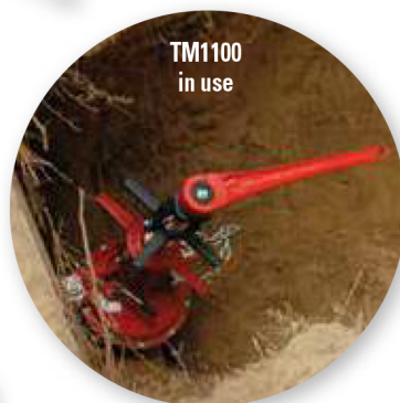
TM1100 in use