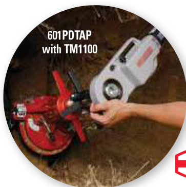
601PDTAP with TM1100