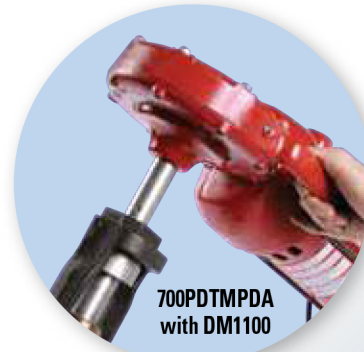
700PDTMPDA with DM1100