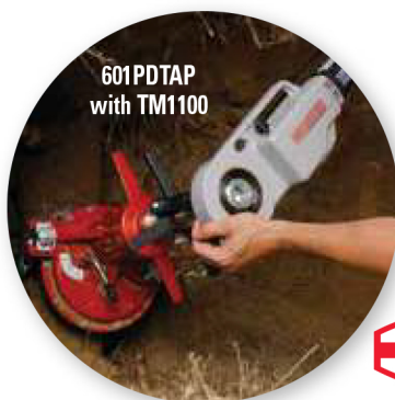
601PDTAP with TM1100