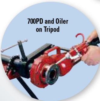
700PD and Oiler on Tripod

700PD POWER DRIVE Ships with Free Safety Arm!