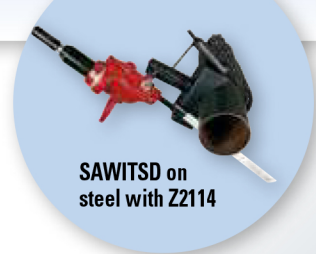
SAWITSD on steel with Z2114

14 TPI (teeth per inch) work best on at least 1/8" wall thickness. 8 TPI work best on walls at least 3/16" thick. Choose 8 teeth per inch for softer materials like plastic.