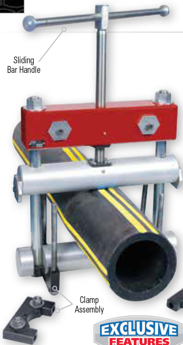
Sliding Bar Handle