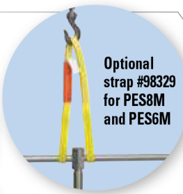
Optional strap #98329 for PES8M and PES6M