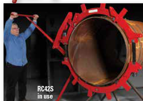
RC42S in use