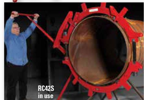
RC42S in use