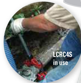
LCRC4S in use