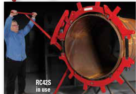
RC42S in use