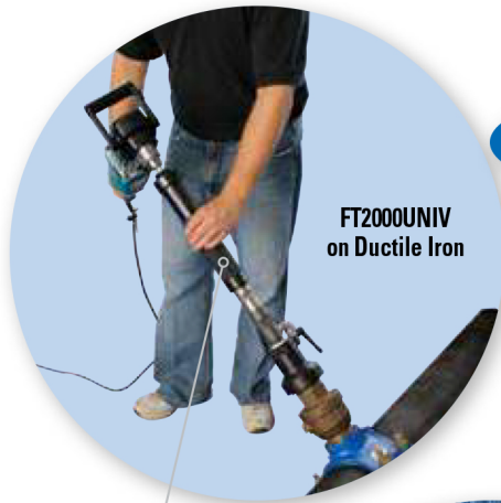
FT2000UNIV on Ductile Iron

Reed's Feed Tap™ drills through PVC, PE, cast iron and ductile iron while under pressure. The compact design, featuring a separate feed for advancing the heavy-duty shell cutter into the pipe, allows the user to easily complete the tap using an electric or cordless drill, right angle drill for cast and ductile iron, or even a 7/16" wrench (drill/wrench not included) with manual power for plastics. The independent feed control advances the shell cutter for tapping PVC pipe as recommended by Uni-Bell PVC Pipe Association. The FTB Feed Tap consists of the base unit which allows the user to purchase shell cutters and corporation adapters separately, as needed. A complete kit is sold as FT2000UNIV . The kit contains both a coupon retaining drill bit, CRPD25 and two sets of coupon retaining magnets. Plastic Pipe only FTP2000UNIV is used for manual drilling operations with Reed's proven PVC/PE Shell Cutters. The FTP2000UNIV comes complete with all corporation adapters, shell cutters, adapters and a ratchet wrench with socket to cover 3/4" to 2" services in PVC and PE. Each machine ships with a sturdy carrying case.