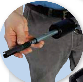
FTPSAA & PL688 attaching to coupling nut

Independent, controlled feed makes this the preferred tool for PVC taps.