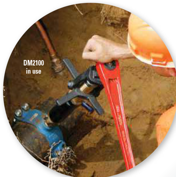
DM2100 in use