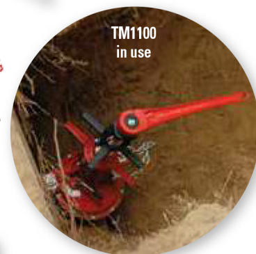
TM1100 in use