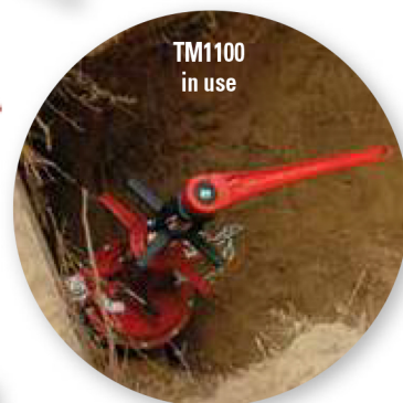
TM1100 in use