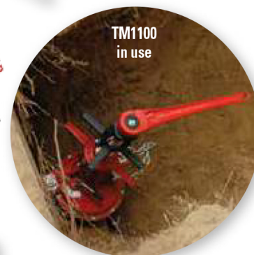
TM1100 in use