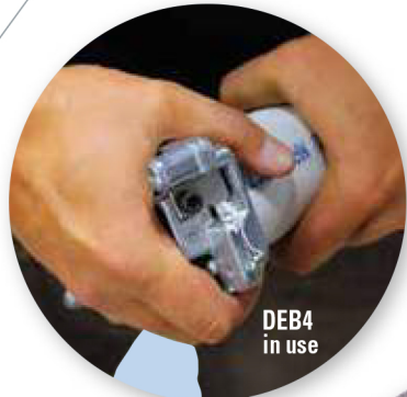
DEB4 in use