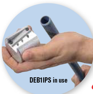
DEB1IPS in use

+ NEW DEB1 Series Deburring Tools on P. 2a.