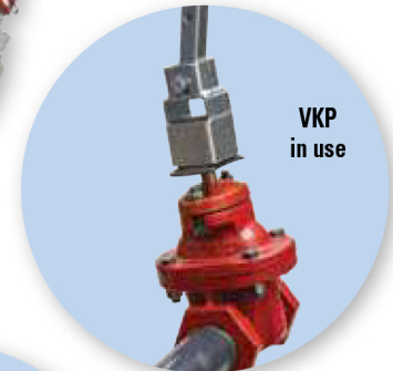
VKP in use

+ MORE Valve Keys on P. 48 of Reed's catalog.