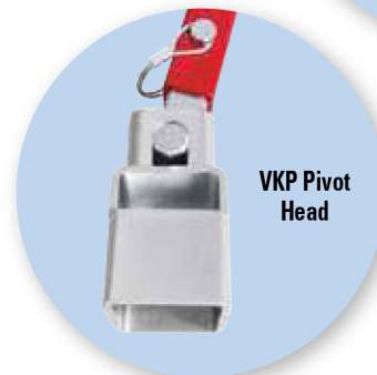
VKP Pivot Head