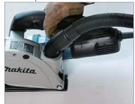
Connectable to vacuum cleaners for clean work environment