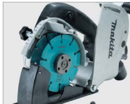
Aluminum blade case designed to allow for easy blade replacement