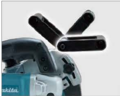
Ergonomically designed front handle