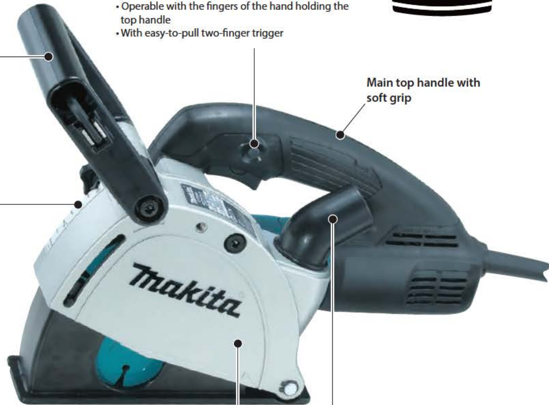
Main top handle with soft grip