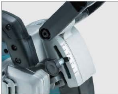
Adjustable cutting depth